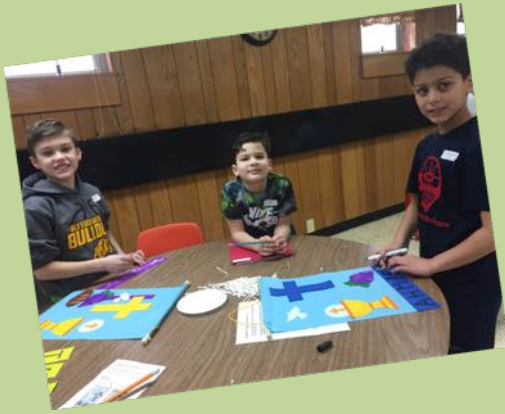
The 3 rd graders are ready for First Communion.